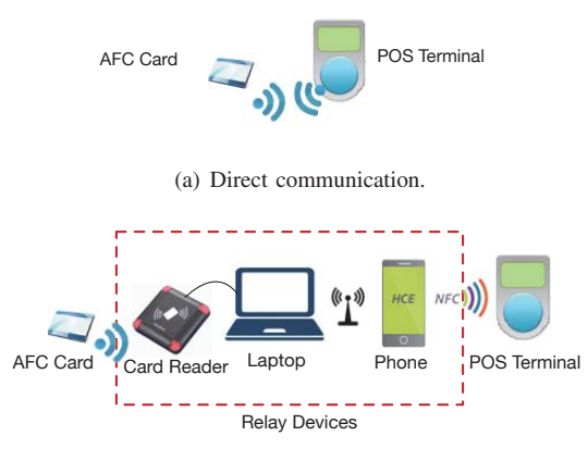
(b) Relayed communication.

In 2013, Android 4.4 introduces a special method for card emulation, called host-based card emulation (HCE). The