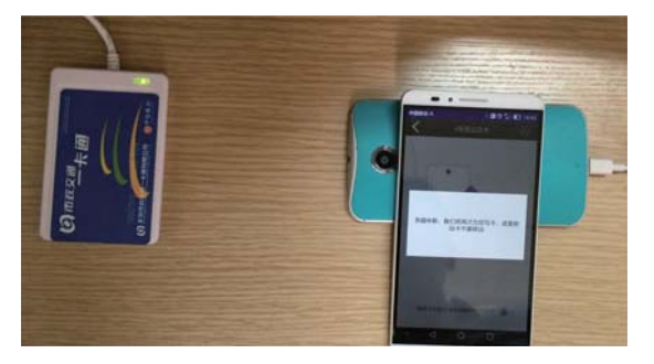
Fig. 3: Relay attack leads a fail top-up.

Then we performed a relay attack using the same equipment. The top-up failed as we expected, shown in Fig. 3: the prompt on the screen means that the top-up has been interrupted and the user will get a refund.